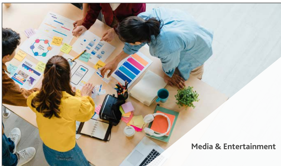
Media & Entertainment